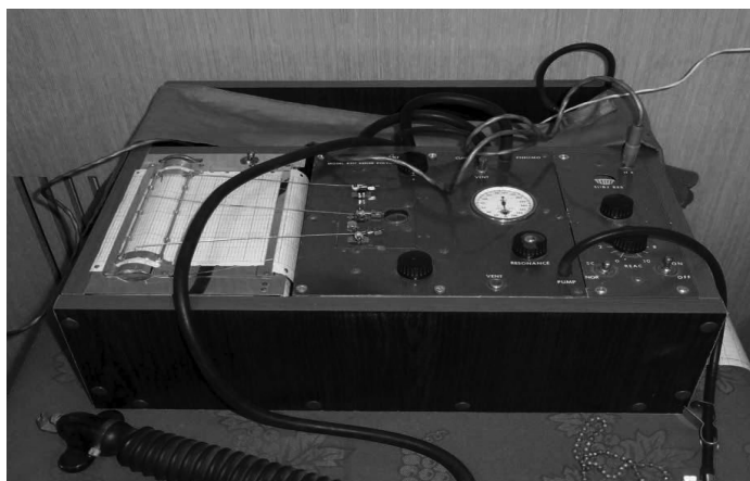
Fig. 1. Keeler Polygraph, model 6306, used since the late 1960s by the Military Internal Service (now in the collection of the Military Police).

polygraphs) [32]. Obtaining one was not easy however. Late in the 1970s American companies did not sell polygraphs to the states “beyond the Iron Curtain”. Even access to literature was made difficult. As late as in 1976 American Polygraph Association refused a Polish subscription of Polygraph quarterly, explaining straightforwardly that “publications of the American Polygraph Association are not sent beyond the Iron Curtain”. The first machine for the Military Internal Service, was a Keeler Polygraph (model # 6306), which was purchased through intelligence channels in 1969. [33]