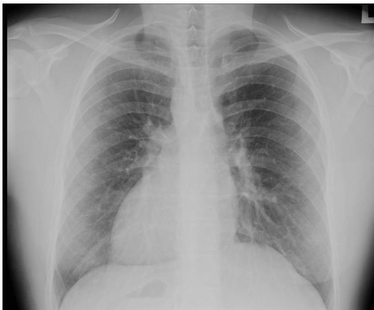
Fig. 3. Chest radiography

IMAGES: A 12-lead surface electrocardiography (ECG) with both standard precordial leads (Figure 1) and right-sided precordial leads (Figure 2) was performed. The standard ECG was notable for inverted P waves in the lateral leads (I and aVL), suggesting rightward atrial electric forces and no R wave progression. The right-sided precordial lead ECG showed normalized R wave progression. These summations of ECG findings are suggestive of dextrocardia. There were also T wave inversions in I and aVL, which are also consistent with dextrocardia but less specific than the other findings. The patient subsequently underwent echocardiography, which confirmed dextrocardia with proper anatomy and function.