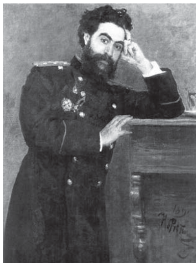
Fig. 3. I. Tarchanoff as professor of the Imperial Military Medico-Surgical Academy (by I. Repin)

Ivan Tarchanoff (born Ivane Tarchan Mauravov Tarkhnishvili), in fact the only East European academic with a significant contribution to the scientific foundations for polygraph examinations, is moreover an exceedingly interesting figure. He was a great scholar of European format, symbolically combining the nations of Central and Eastern Europe. A Georgian aristocrat, a graduate of a Russian university and later a member of the Russian faculty, a professor of the Military Medico-Surgical Academy in Saint Petersburg, he was an avid experimenter in what is broadly construed as physiology and a promoter of science.