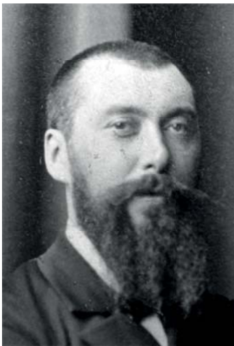
Fig. 1. Ch.S. Féré

As mentioned above, in his experiment, Féré attached two electrodes connected in series to a weak source of electricity and to a galvanometer to the forearm of the patient whom he later subjected to a range of sonic, olfactory, and visual stimuli. Such stimuli had the galvanometer pointer moving. Initially, Féré believed this to be the result of friction on dry skin. Yet Jaques-Arsene d'Arsonval (1851–1940), a physicist he collaborated with, realised that the change in conductivity was linked to sweating (d'Arsonval 1888). Thus, what we refer today as the 'Féré phenomenon' should more properly and justly be called 'the phenomenon of Féré – d'Arsonval'.