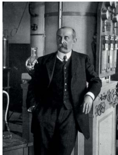
Fig. 2. J.A. d'Arsonval

In his publication from 1890, Ivan Tarchanoff presents the discovery that the galvanometer reacts similarly to stimuli even in the absence of an external source of energy (Tarchanoff 1890). The scientist attached electrodes to two randomly chosen points